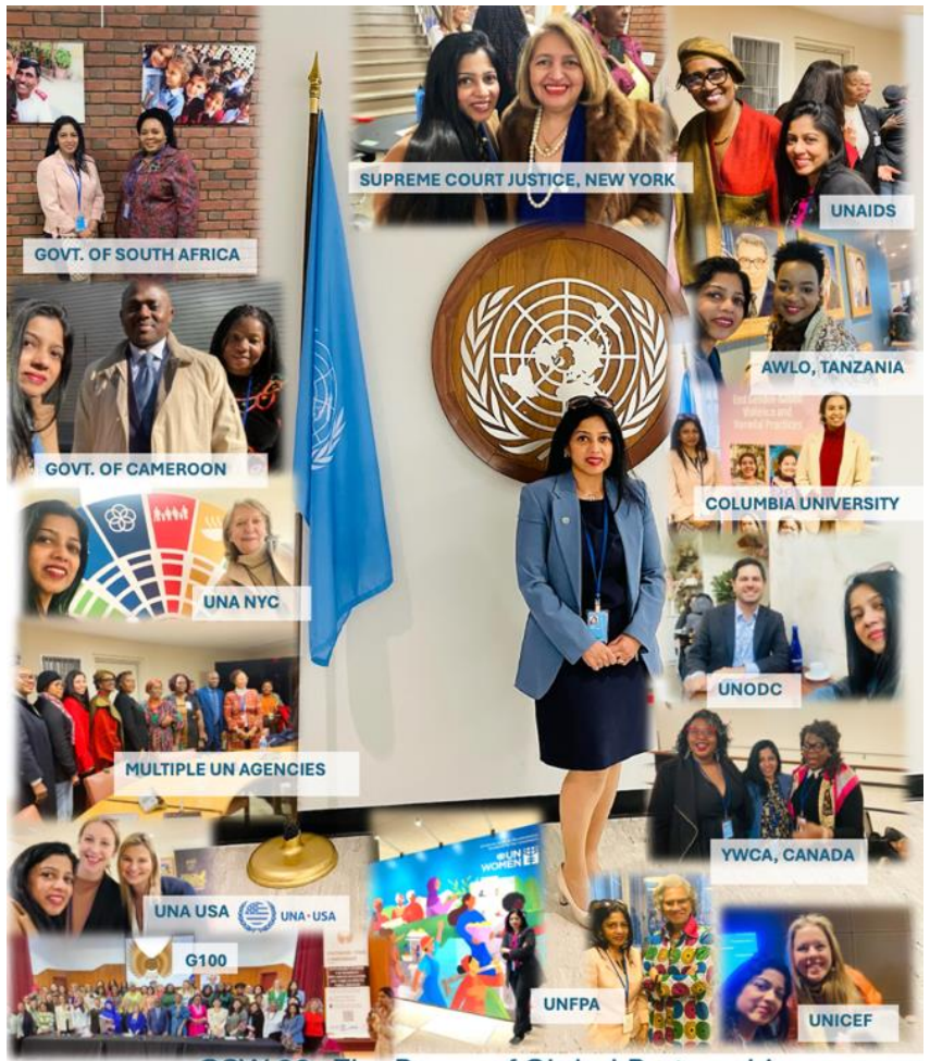
CSW 68: The Power of Global Partnerships

By fostering dialogues, highlighting intersectional challenges, amplifying marginalized voices, advocating for policy change, celebrating progress in the SDGs and committing to future action, CSW68 reaffirmed the importance of integrating gender perspectives into global initiatives and programs. The support provided by the entire UNA-USA Leadership team was fantastic; it made each CSW68 session, a memorable and impactful one!