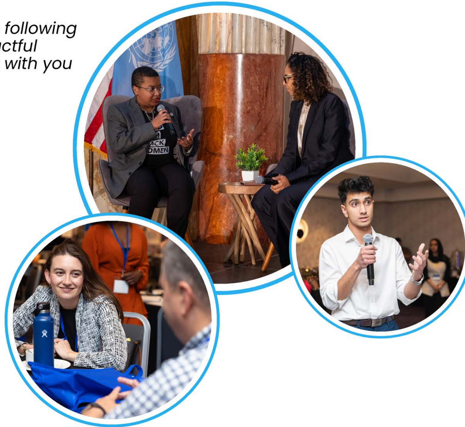
EXHIBIT & ENGAGEMENT TABLE SPONSOR – $1,000